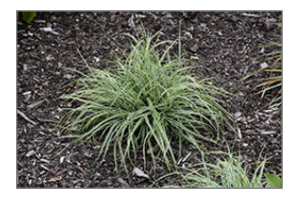
EverColor Everest Japanese Sedge

This is a relatively low maintenance plant, and is best cleaned up in early spring before it resumes active growth for the season. It has no significant negative characteristics.