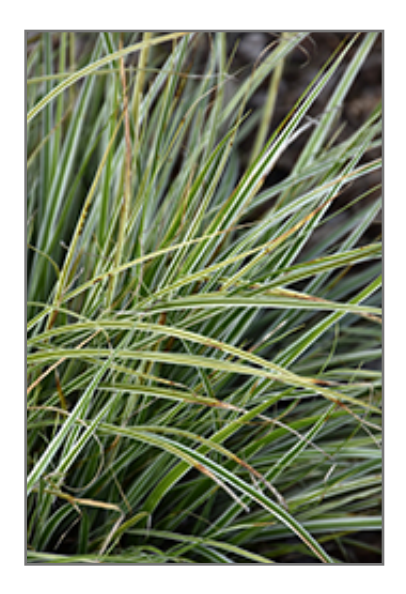
EverColor Everest Japanese Sedge foliage

EverColor Everest Japanese Sedge is recommended for the following landscape applications;