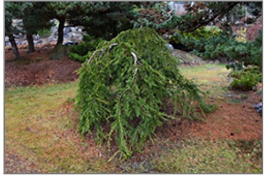
Repandens Deodar Cedar