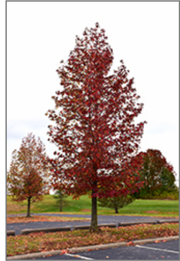
Happidaze Sweet Gum in fall