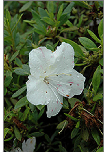
Encore Autumn Starlite Azalea flowers