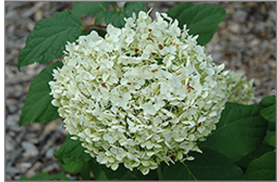
Bounty Hydrangea flowers

Bounty Hydrangea will grow to be about 4 feet tall at maturity, with a spread of 4 feet. It tends to be a little leggy, with a typical clearance of 1 foot from the ground. It grows at a fast rate, and under ideal conditions can be expected to live for approximately 20 years.