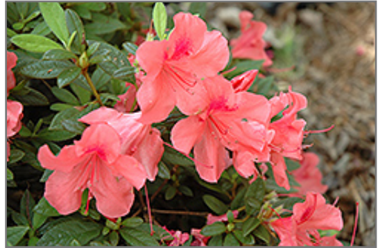
Encore Autumn Coral Azalea flowers

Clustered blooms that are deep coral, with hot pink flecks, cover this azalea in mid-spring with additional, lighter flushes in summer and fall; deep green glossy foliage emerges light green; needs highly acidic and organic soil that is well drained