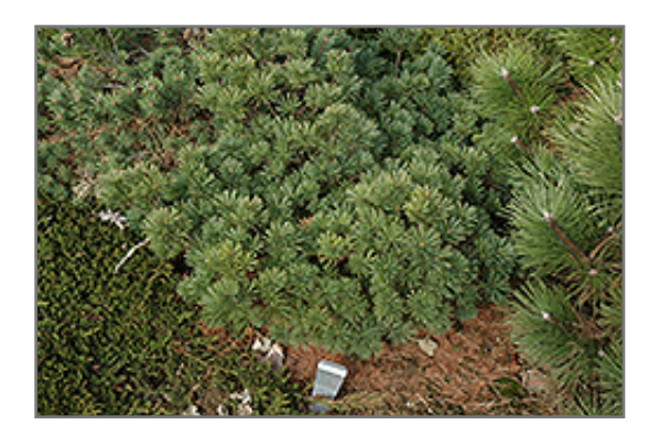
Bergmann's Mini White Pine