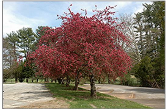
Purple Flowering Crab in bloom