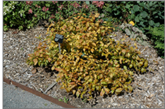
Flower Power Button Bush