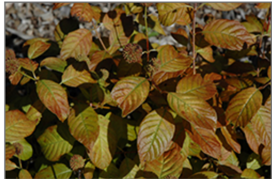
Flower Power Button Bush foliage