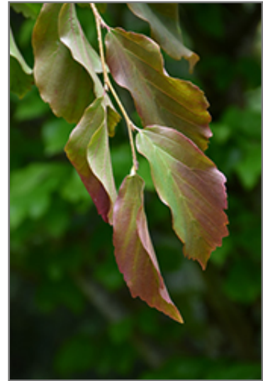
Ruby Vase Parrotia foliage