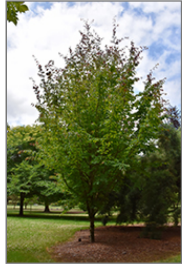
Ruby Vase Parrotia