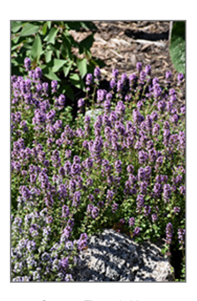
Oregano Thyme in bloom