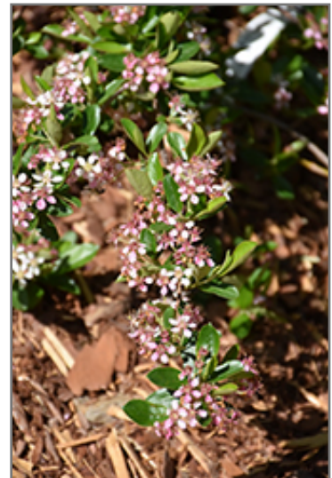
Ground Hug Aronia flowers