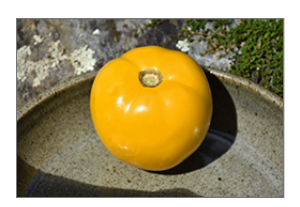
Lemon Boy Tomato fruit

Lemon Boy Tomato will grow to be about 5 feet tall at maturity, with a spread of 24 inches. When planted in rows, individual plants should be spaced approximately 3 feet apart. Because of its vigorous growth habit, it may require staking or supplemental support. This fast-growing vegetable plant is an annual, which means that it will grow for one season in your garden and then die after producing a crop.