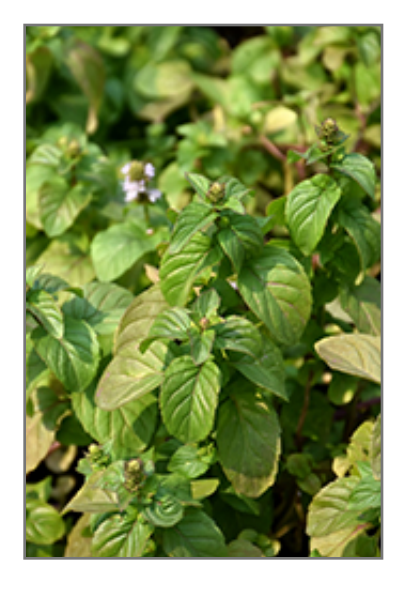
Orange Mint foliage

403 Green Village Road Green Village, NJ 07935 Phone: 973.377.8703 thefarmatgreenvillage.com