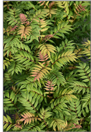
Mr. Mustard False Spirea foliage