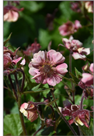
Tempo Rose Avens flowers

Tempo Rose Avens is recommended for the following landscape applications;