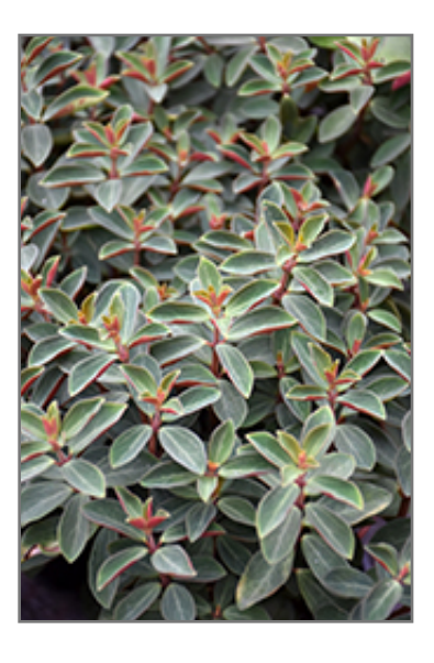
Red Log Peperomia foliage

When grown indoors, Red Log Peperomia can be expected to grow to be about 12 inches tall at maturity, with a spread of 18 inches. It grows at a slow rate, and under ideal conditions can be expected to live for approximately 5 years. This houseplant should only be grown away from direct sunlight or in a room with strong artificial light. It does best in average to evenly moist soil, but will not tolerate standing water. The surface of the soil shouldn't be allowed to dry out completely, and so you should expect to water this plant once and possibly even twice each week. Be aware that your particular watering schedule may vary depending on its location in the room, the pot size, plant size and other conditions; if in doubt, ask one of our experts in the store for advice. It will benefit from a regular feeding with a general-purpose fertilizer with every second or third watering. It is not particular as to soil type or pH; an average potting soil should work just fine.