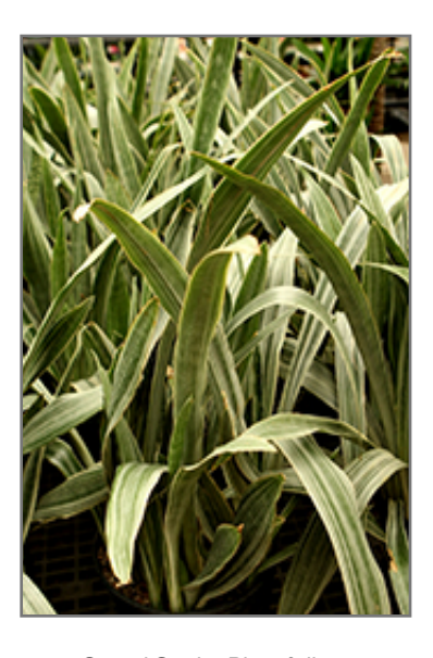
Sayuri Snake Plant foliage

When grown indoors, Sayuri Snake Plant can be expected to grow to be about 3 feet tall at maturity, with a spread of 18 inches. It grows at a slow rate, and under ideal conditions can be expected to live for approximately 10 years. This houseplant performs well in both bright or indirect sunlight and strong artificial light, and can therefore be situated in almost any well-lit room or location. It is very adaptable to both dry and moist soil, and should do just fine under average home conditions. The surface of the soil shouldn't be allowed to dry out completely, and so you should expect to water this plant once and possibly even twice each week. Be aware that your particular watering schedule may vary depending on its location in the room, the pot size, plant size and other conditions; if in doubt, ask one of our experts in the store for advice. It will benefit from a regular feeding with a general-purpose fertilizer with every second or third watering. It is not particular as to soil pH, but grows best in sandy soil. Contact the store for specific recommendations on pre-mixed potting soil for this plant.