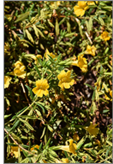
Bush Monkey Flower flowers

Bush Monkey Flower makes a fine choice for the outdoor landscape, but it is also well-suited for use in outdoor pots and containers. Because of its spreading habit of growth, it is ideally suited for use as a 'spiller' in the 'spiller-thriller-filler' container combination; plant it near the edges where it can spill gracefully over the pot. It is even sizeable enough that it can be grown alone in a suitable container. Note that when grown in a container, it may not perform exactly as indicated on the tag - this is to be expected. Also note that when growing plants in outdoor containers and baskets, they may require more frequent waterings than they would in the yard or garden.