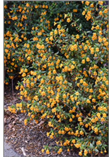
Bush Monkey Flower in bloom

Bush Monkey Flower is recommended for the following landscape applications;