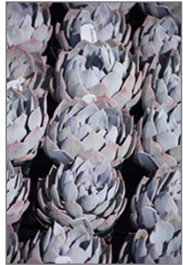
Canadian Echeveria