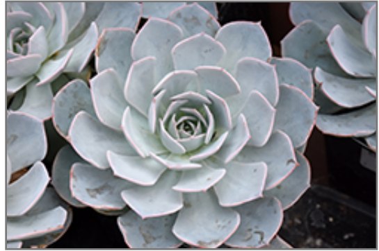
Canadian Echeveria