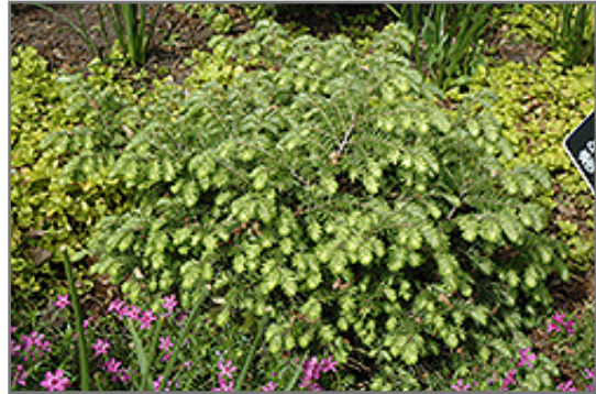
Moon Frost Hemlock

Moon Frost Hemlock is recommended for the following landscape applications;