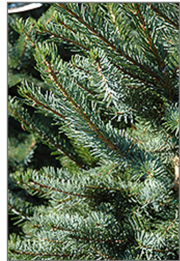
Bruns Spruce foliage