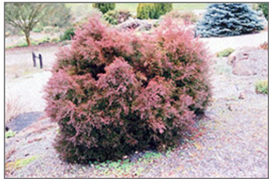
Ericoides Whitecedar in winter