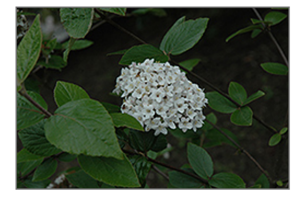
Chenault Viburnum flowers