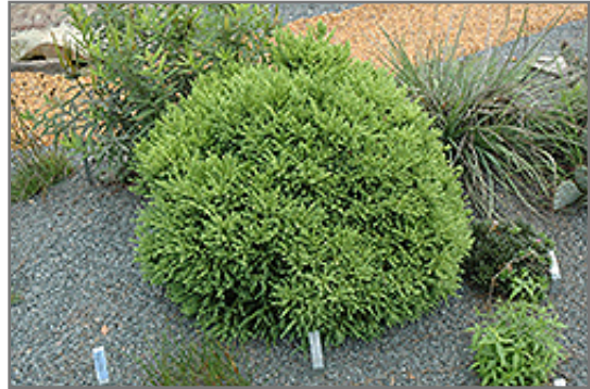
Little Diamond Japanese Cedar