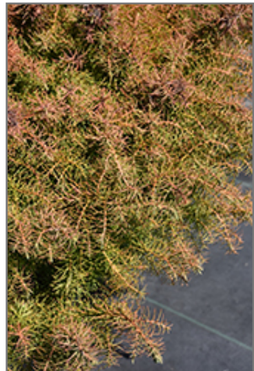
Mushroom Japanese Cedar foliage