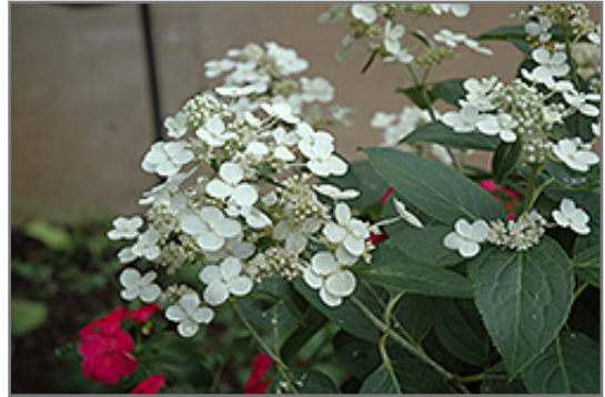
Dharuma Hydrangea flowers